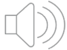
Public Announcement System