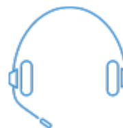
Audio and video peripherals